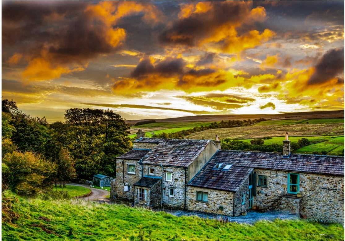
Deerclose West Farmhouse, Coverdale, Yorkshire Dales