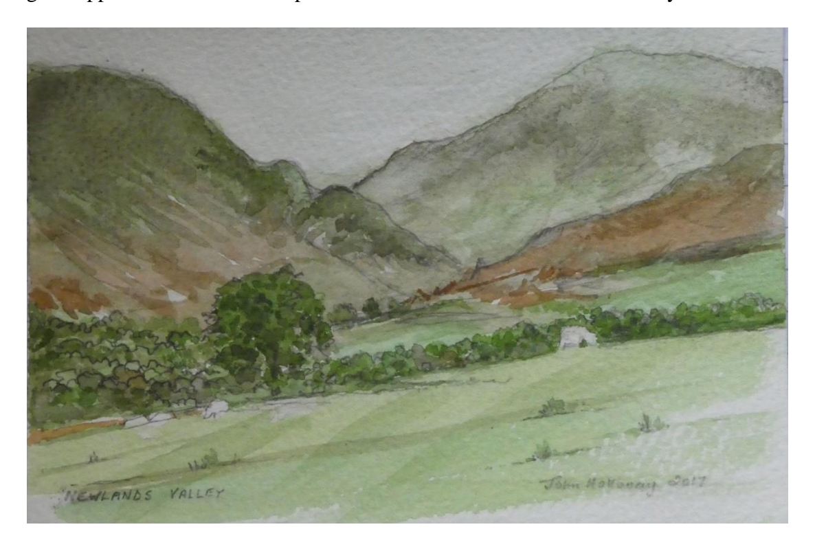
Newlands Valley looking South from Birkrigg: John Holloway

Newlands valley is a delightful area between Keswick and Buttermere. Our first day found us on Hindscarth above Buttermere in a fierce SW wind. The more adventurous continued over Dale Head with fine views over the Buttermere Fells to Great Gable. The less adventurous descended in the lee of the mountain to Newlands Valley. The second day brought low cloud, rain and a variety of low level walks. One such provided good opportunities for landscapes as the water colour of Newlands Valley shows.