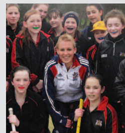
PAGE 3 HOCKEY FESTIVAL