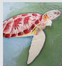
PAGE 5 ART