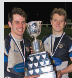
PAGE 7 STERNIANS