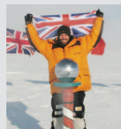
PAGE 8 SOUTH POLE