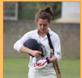
Girls' cricket page 5