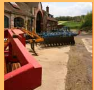
Food and Farming page 8