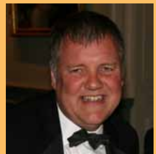
Lord's Dinner page 6