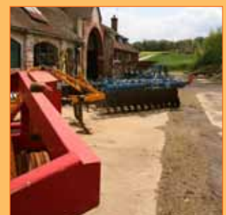
Food and Farming page 8