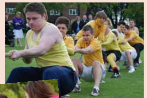
Congratulations to Superteams winners 2010: Sutton House and Haygate. Pictured: Valiant losers Summerfield and Park.